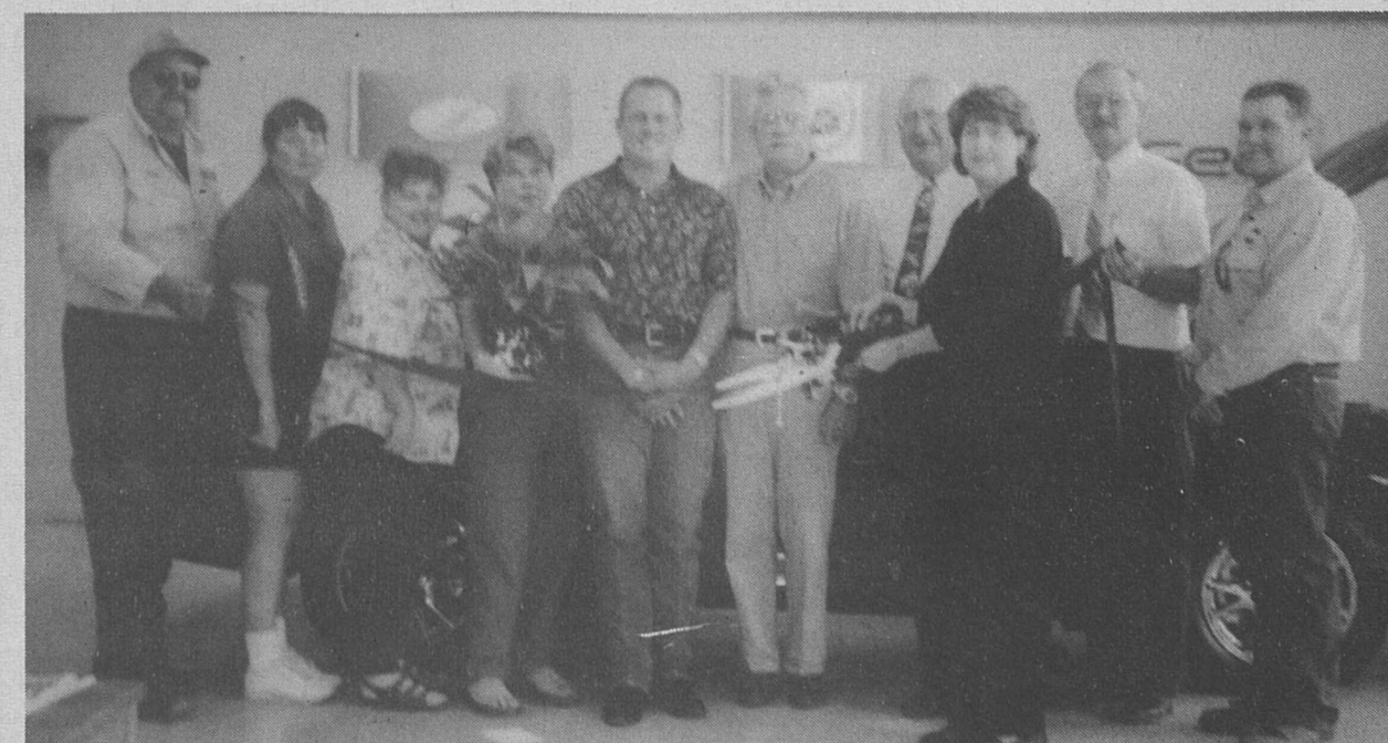
Ellison Chevrolet, Cadillac cuts ribbon