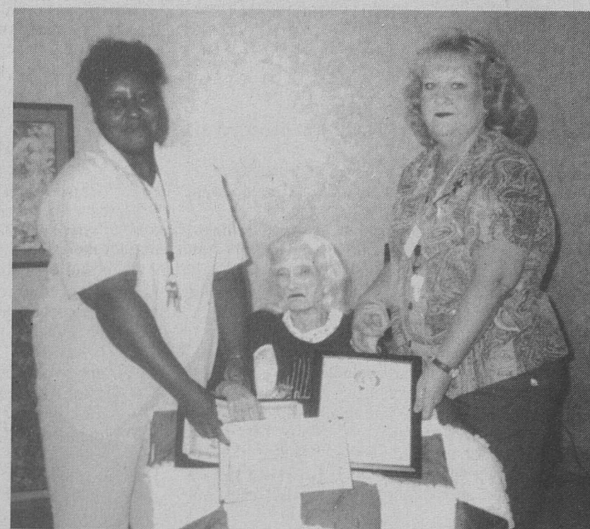
103 Years young

such a welcome surprise when you're driving along a street and see the effort someone made to improve the view. We can all make a difference with little effort or expense. Thanks, Doug.